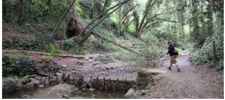
In "Trailhead," discover Oakland's gateway to the redwoods